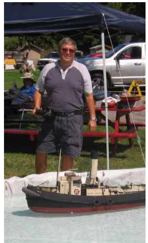
Above: An amazingly detailed model boat cruises by remote control in our temporary lake.