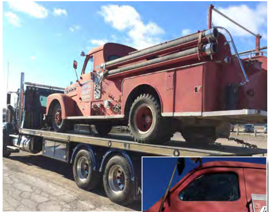
Above: "Going home for a visit!" The Six Nations pumper loaded on a flatbed for its journey back to Ohsweken, Ontario to be a guest of honour! At Right: The Six Nations Truck door with its original graphics.

This is an exciting time for the Museum, which is on the verge of significant growth, and it's a very good time for those who may be interested to become involved as a volunteer, or committee member.