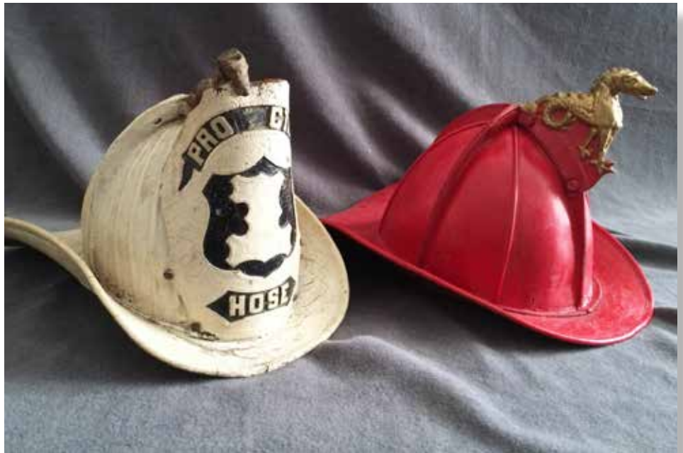
Above: Two fabulous, early leather fire helmets donated from the Ontario Fire College Read more...

I could go on about the terrific items we've found in some of the totes and boxes, but what I want to stress is that