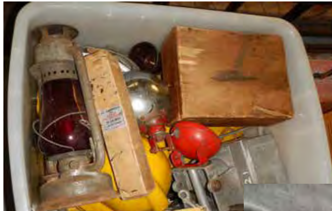
At Left: We received many, many bins of assorted, vintage firefighting gageetry of all kinds!

All parties agree, this addition will significantly increase the importance of the Canadian Fire Fighters Museum in the preservation of the history and artifacts of firefighting in Canada.