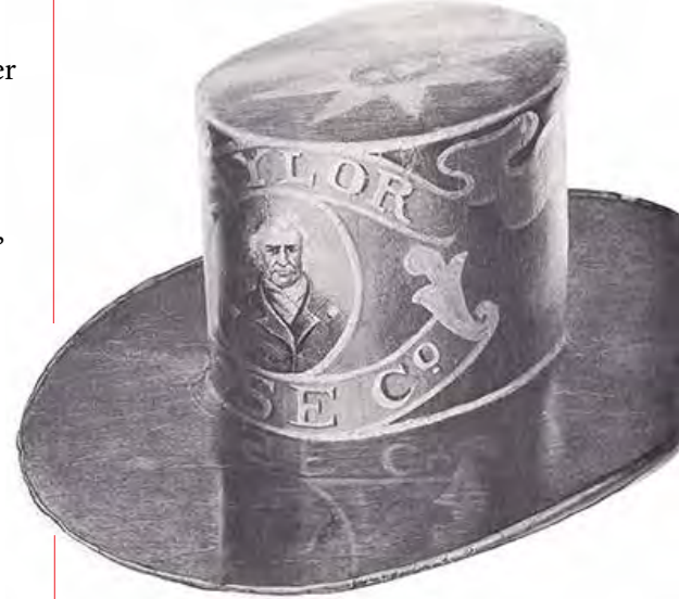
Above A primitive "Stove Pipe" firefighters hat (American, not in CFFM collection)

In the meantime, an informative article on helmets can be found here: http://uniformstories.com/articles/opinion-category/the-tradition-and-history-of-the-american-fire-helmet