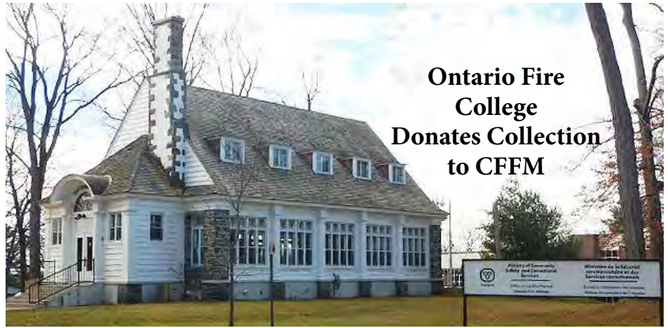
Above: The Ontario Fire College in Gravenhurst, ON