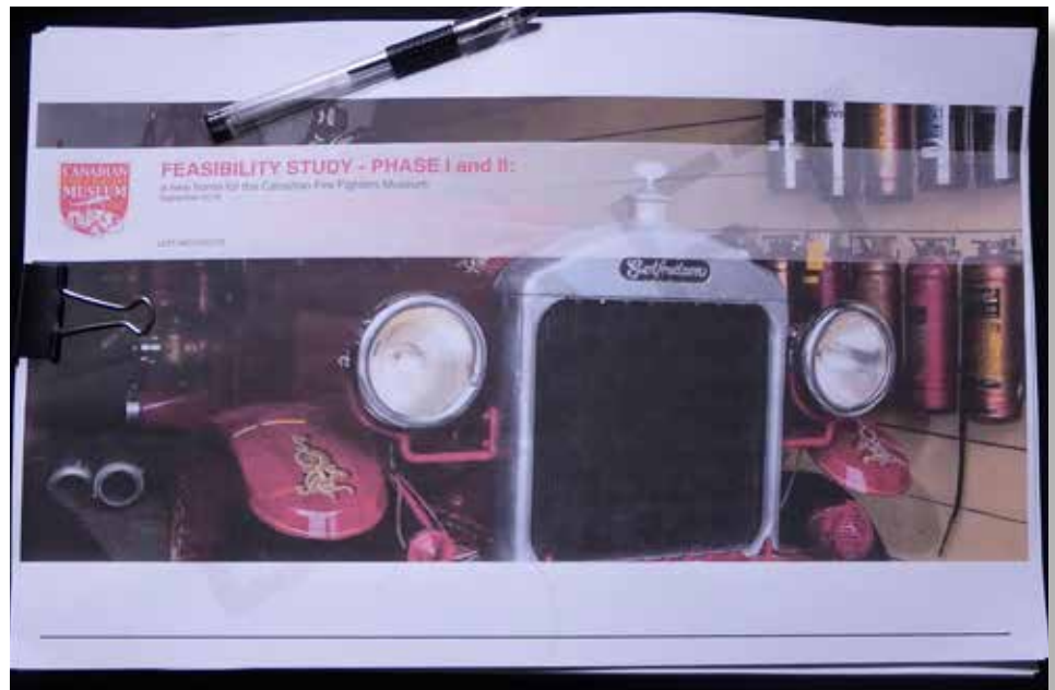
Above: Front cover of CFFM Feasibility Study written by Lett Architects. Over 80 pages of information.

An earlier planned presentation to Council had to be delayed as the Board needed more time to go over the study for final approval. Due to some scheduling conflicts it now looks like the Council meeting on November 1st will be the soonest we can present it publicly.