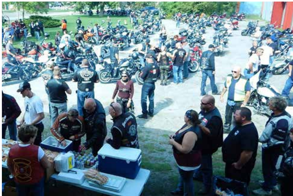
Above: Members of the Firefighter Red Knights Motor Cycle Club at their yearly charity ride event headquarters on the CFFM grounds. Almost 100 fabulous motorcycles fill the parking lot! Read more >>