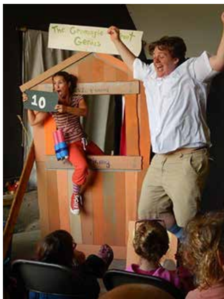
Above: Audience enjoys a scene from the play which was fun and lively and had a great message about bullying!

It was a very successful day for the Museum with over 85 people visiting. Holding an event like this was a first for CFFM. It meant some exhibits in the truck area needed to be rearranged to create space—the 1941 GMC and the air raid pumper (whose tire was repaired the previous day by Northumberland Tire at no charge) outside. We moved the Kingston pumper over close to the 1926 Gotfredson and pushed everything else up against the back wall to create a big enough space to stage the play.