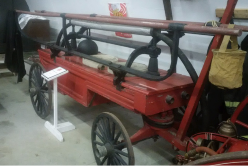
Above: Side stroke "piano-box" engine, CFFM collection on loan from the town of Orillia.

The Fire Mark is the Newsletter of the Canadian Fire Fighters Museum. Port Hope, Ontario www.firemuseumcanada.com Facebook.com/FireMuseumCanada