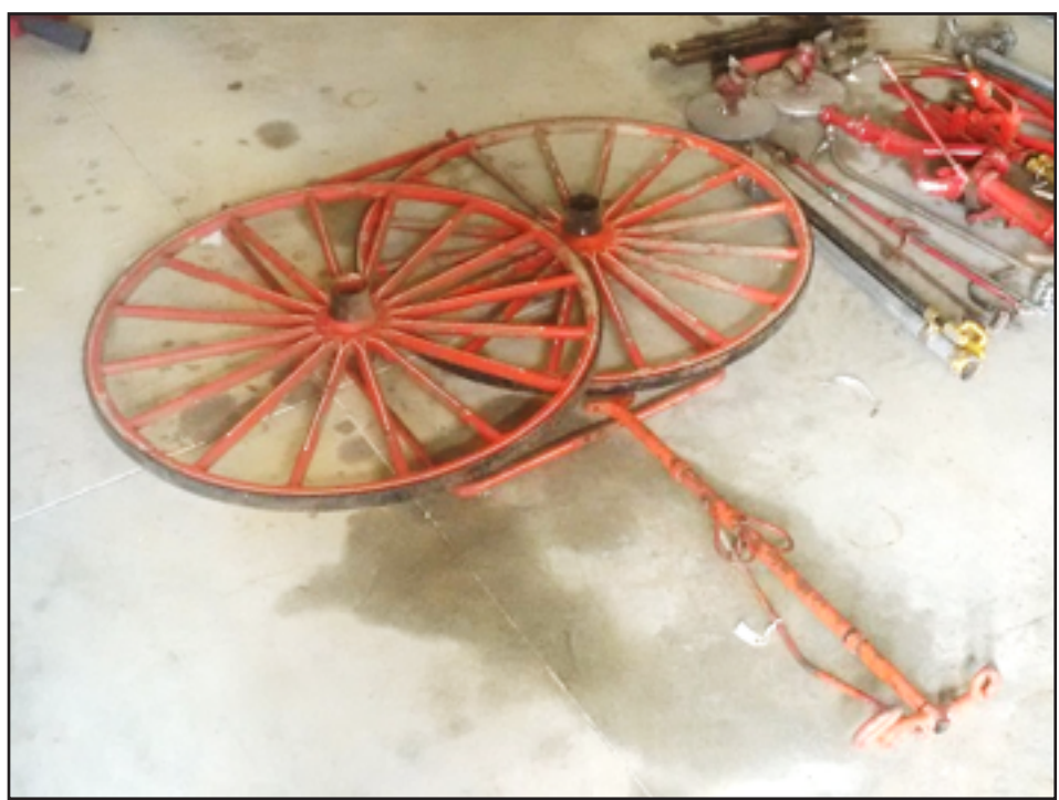
Above Top: Wheels and frame on North Wall