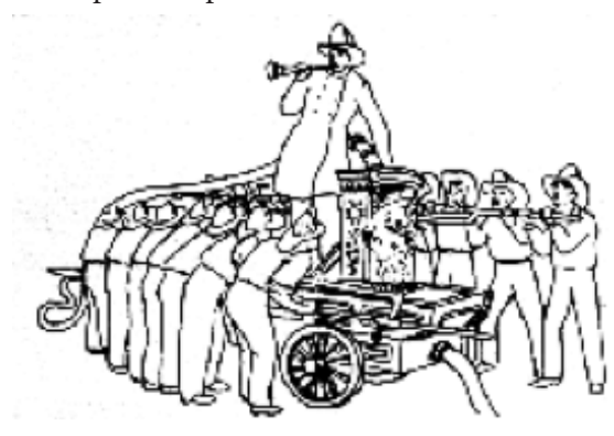
Above: A "New York" style, side-stroke engine with a goose-neck discharge.

Two common designs of these pumps are described in a comprehensive article by the Aurora Regional Fire Museum in Illinois, that can be found on the internet. Earlier models were able to "push" water out of their reservoirs (the "tub") but were not designed for suction. These tubs had to be kept filled by bucket brigades before the engine designs improved to add suction capability or pressurized municipal water systems were developed to feed them from hydrants. There is a lot of interest in restoring these old engines and holding competitions and demonstrations of their operators' prowess.