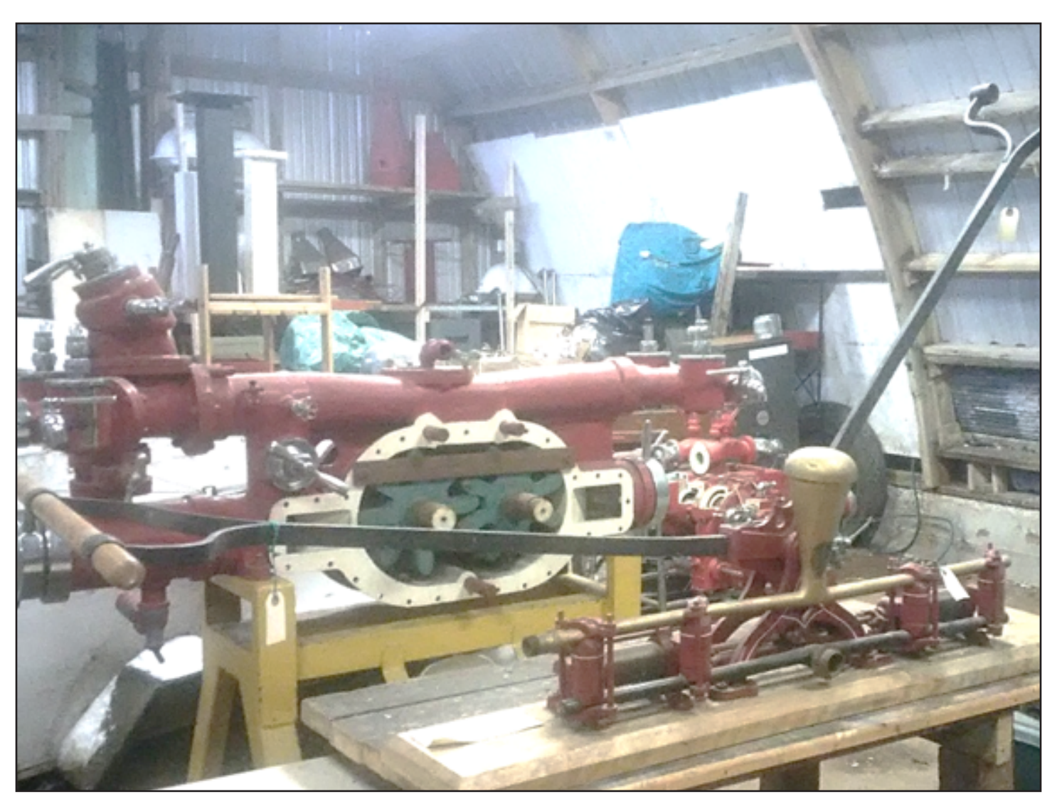
Above Top: Portable hose press tool after re-assembly (front and back views) Above: Fully assembled 2-man portable pump from Ontario Fire College, Gravenhurst, formerly from Stratford, Ontario. As the photo shows, the Museum had a lot of items in storage due to the short supply of exhibit space in the public areas. (Truck-mounted pump in background is a huge contrast in scale)