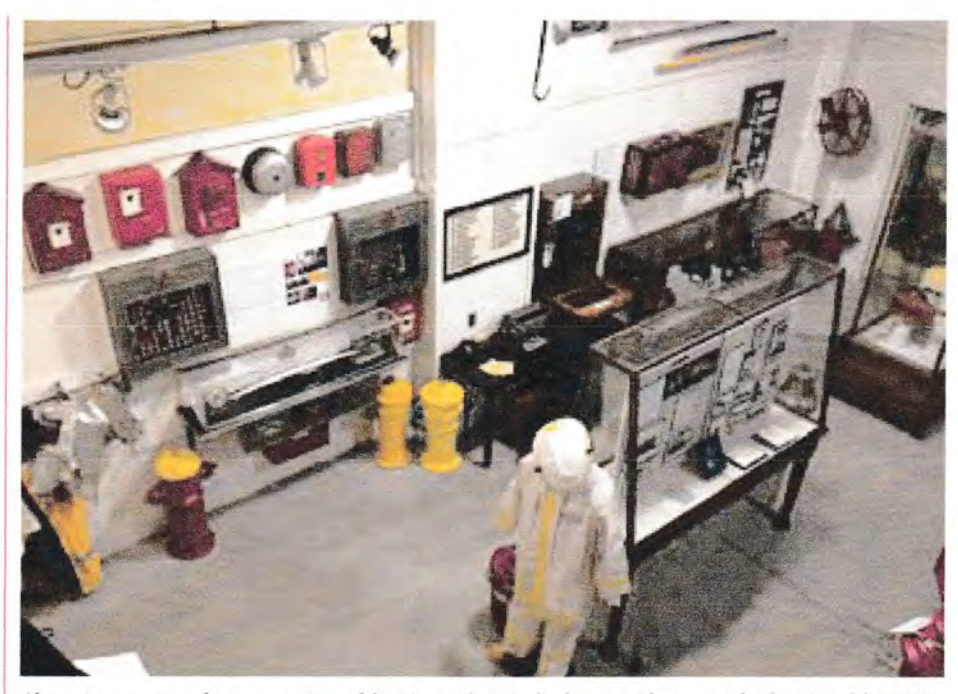
Above: An overview of just one section of the Museum's main display area. The newest display, Canada's WWII Overseas Fire Fighting Battalion is at centre right. Below: Summer student, Kate Lawler, enters data using our new cataloging workstation purchased with funds raised at our Red Door Party events this year..

It's been a busy summer for board members and volunteers alike - we