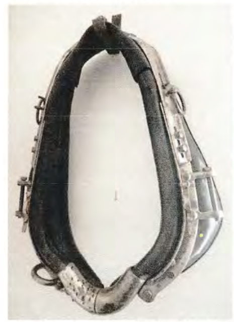
Above: A "quick hitch" hose collar allowed fire fighters to quickly hitch up the horses to the rolling stock to get to the fire sooner.

Fire Department horse collar. Built small and light because these fire department horses already had to pull heavy loads at high speeds. The collars were unique in that they had a hinge at the top allowing them to open at the bottom. They would hang open from the ceiling of the fire hall and when the alarm sounded the well-trained horses would walk up and stand below them. The entire harness was then lowered onto the waiting animals and quickly connected. This resulted in amazing quick "turn-out" times.