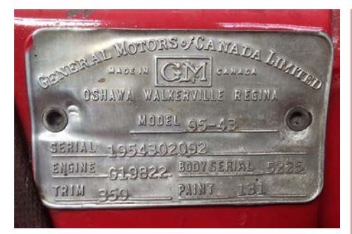
Above: An example of a Data Plate with full details.

ity of owner Walter Hillman, our fire tower and other weather resistant items are held in the compound on that building's exterior along with a shipping container we bought that is full of smaller items.