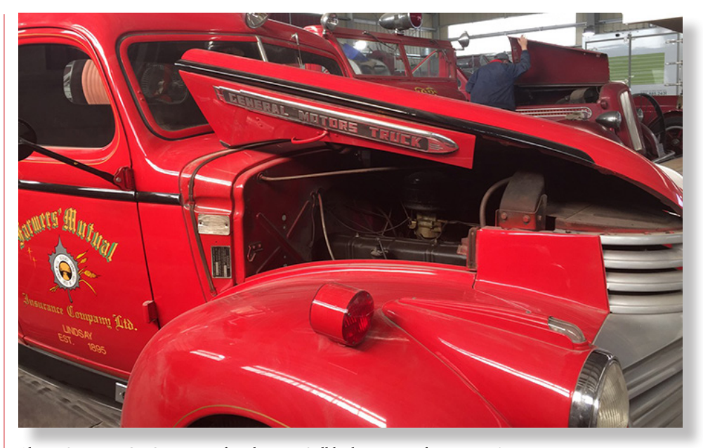
Above: Our 1941 GMC Pumper after cleaning. Still looking great after 80 years!

Thank you again for your membership — the strongest way you can express your support.