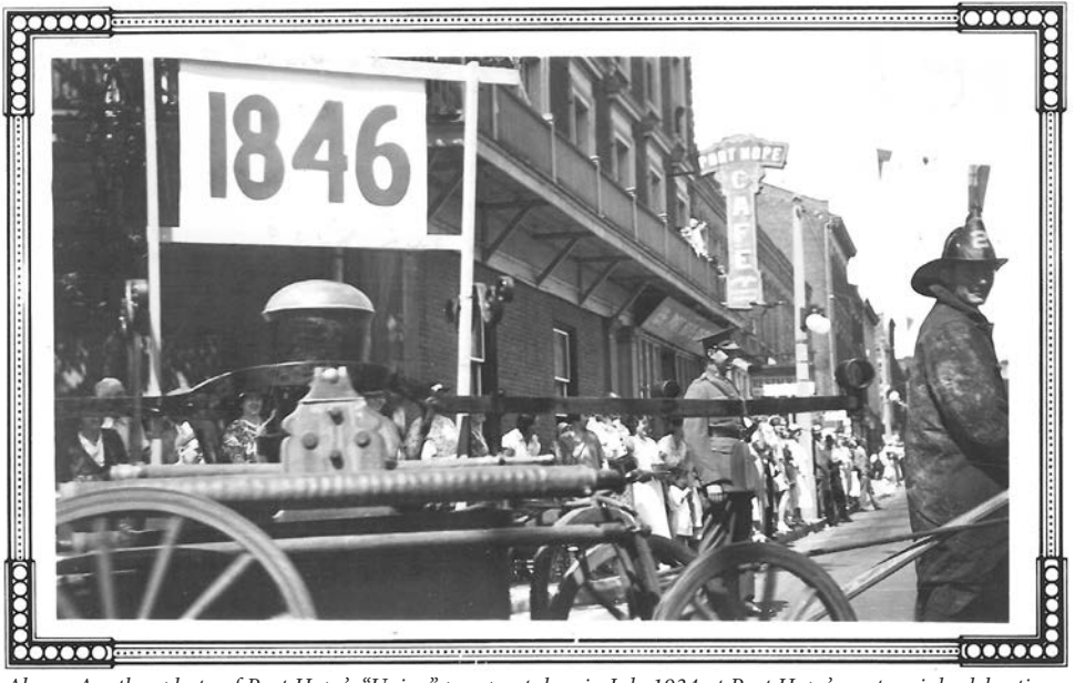
Above: Another photo of Port Hope's "Union" pumper taken in July 1934 at Port Hope's centennial celebration.

In the late 1970s the O.F.B.A. was gaining momentum and recognized that many community museums had displays of their local fire service history, and some larger provincial and federal institutions had some related