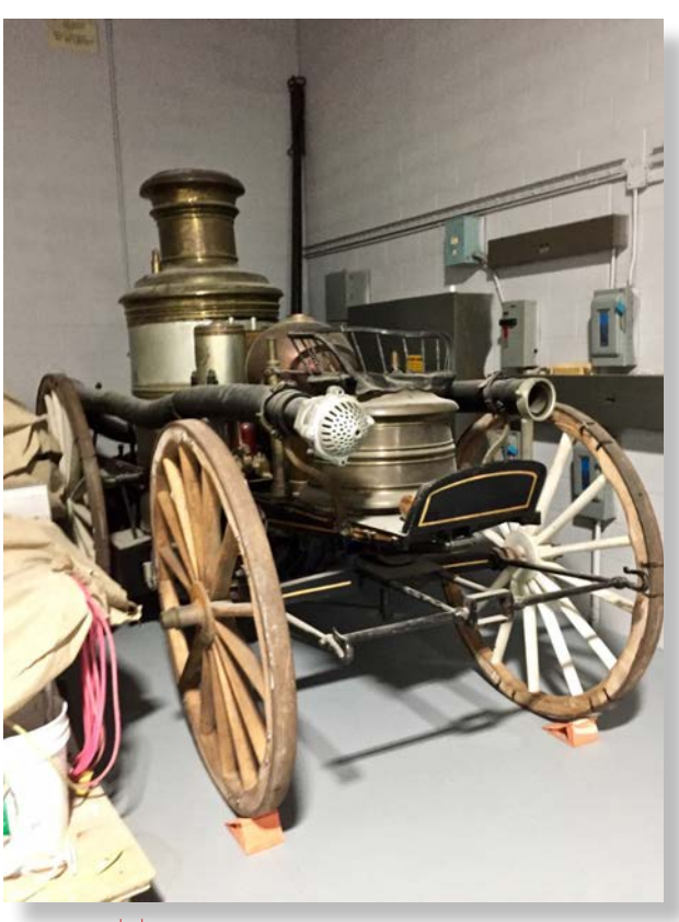
Above: Our 1866 Amoskeag Steam Pumper is safe and dry, heated storage at the building on Robertson Street.

Having had the opportunity to see the collection in its entirety in a condensed period of time I think I can say with confidence that it is a