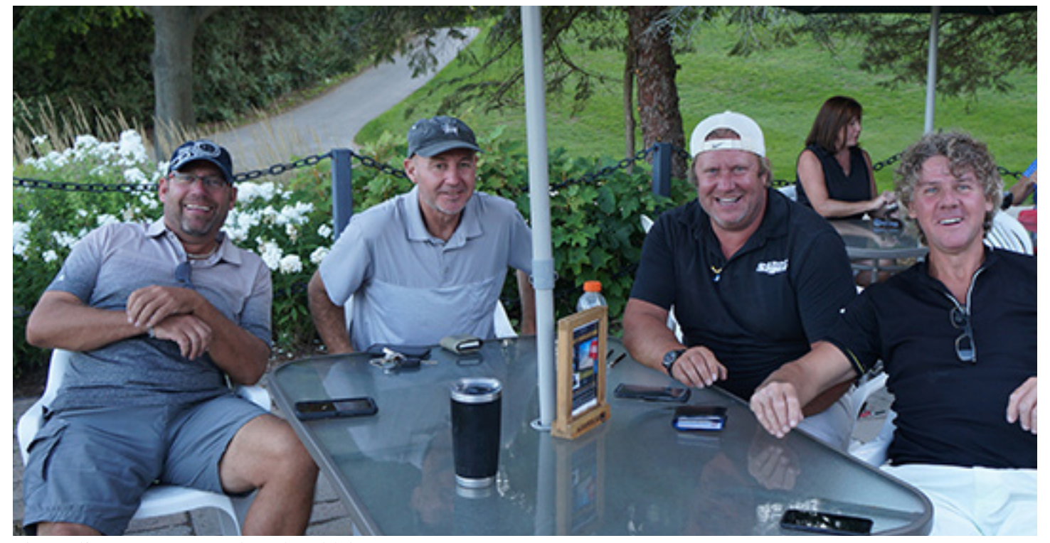
Above: Golf Tournament Winners relax at the 19th hole!

2020 certainly presented us all with a whole new set of challenges. Our Second Annual Golf Tournament was no exception. The original event was scheduled for Saturday, August 29, 2020. The night before, the golf course received over 40 centimetres of rain which forced a postponement by our host Dalewood Golf Club.