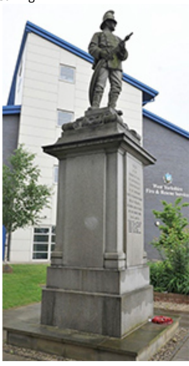
The Low Moor firefighters memorial after restoration at West Yorkshire Fire & Rescue headquarters

Bradford is a city that expanded exponentially in response to the Industrial Revolution as steam power underpinned its pre-eminent position in wool weaving.