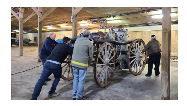
Above: Museum volunteers carefully move the Amoskeag Steam Pumper into new storage.

I retired recently as a Captain with Toronto Fire Services. My career started as a 2-year volunteer with Ilderton, Ontario followed by a military firefighter career doing both structural and aviation firefighting. I moved to the Scarborough Fire Department which amalgamated into Toronto Fire Services at the end of the 1990s.